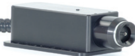
(FCL-B3000 and FCL-B4000 Series)

Various CleanBlast Adapters are available for most common connector types.